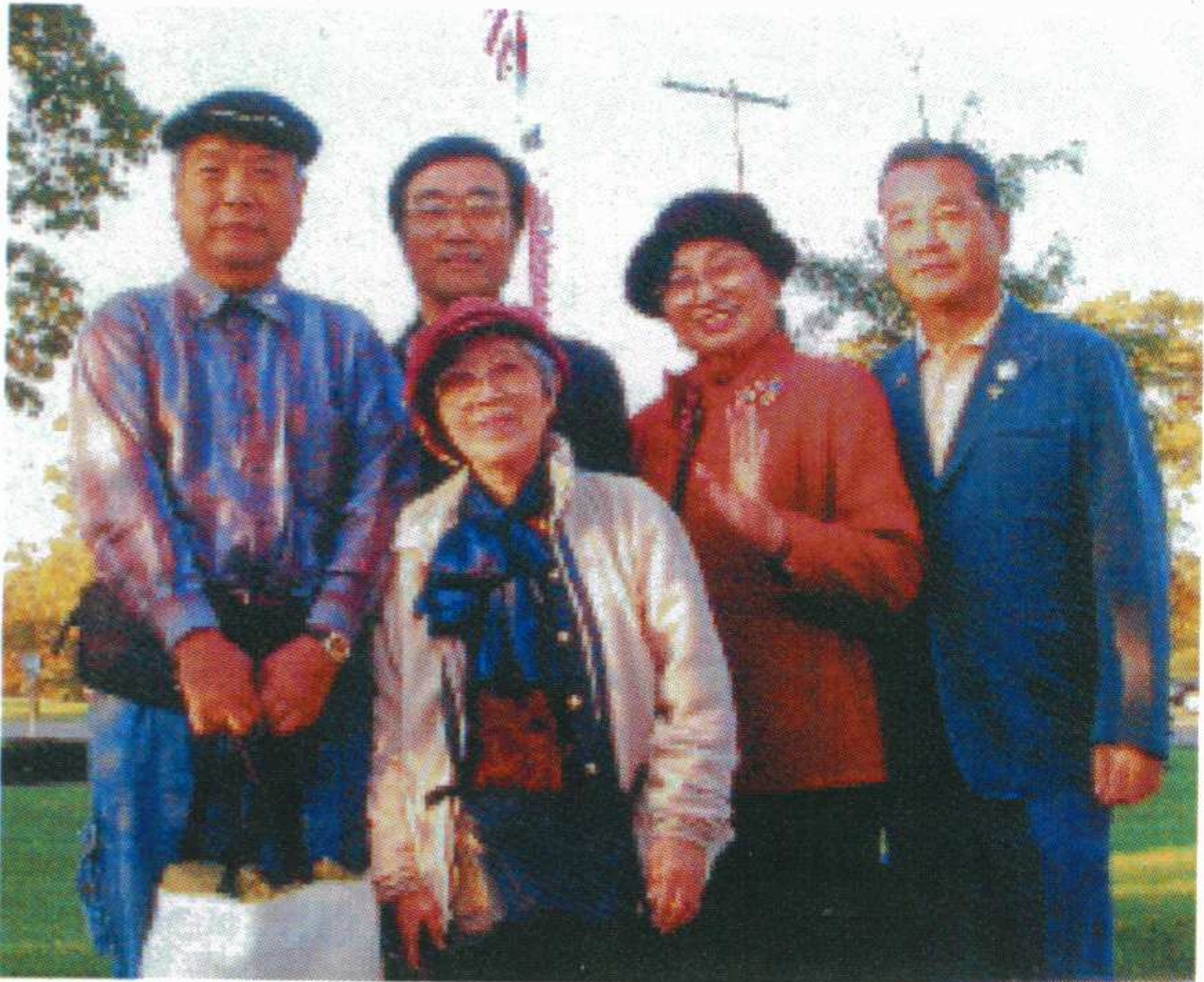
Visitors from the 2002 Sayama delegation gather on the front lawn of City Hall.

Approved by the Worthington City Council, a 20-member board of directors governs WIFA. We draw our membership from residents of the City of Worthington, the Worthington School District, and other communities in central Ohio.